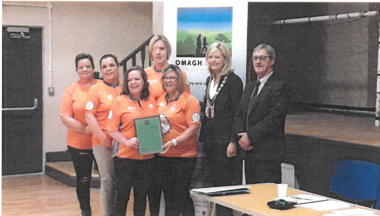
Participants from Cycle of Hope receiving their Community Award at 2019 AGM & Community Awards Event

We were involved in discussions on the DAERA Rural Policy Framework looking at future direction of services, which include TRPSI and the Rural Development Programme. Staff were involved in the Rural Society Employability working group, one of the five working groups looking in detail at various aspects of rural society. Staff also attended a DAERA stakeholder engagement event on 16th January in Loughrey College.