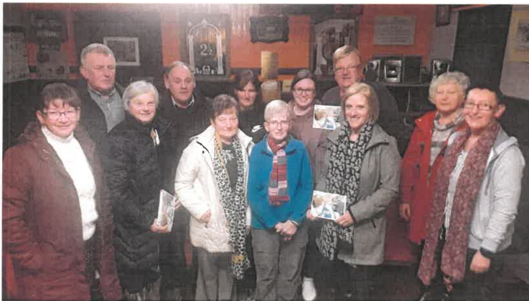
First Aid participants in Newtownsaville Orange Hall, February 2020

Our training programme began in April 2019 with Basic Finance delivered to a number of groups hosted by Eskra Community Association. Reporting to the Charity Commission training took place on October 2019 in Omagh Community House closely followed by First Aid in Newtownsaville Orange Hall and good governance training in October. The three October training sessions were primarily focused on older people to tie in with Positive Ageing month, a series of events co-ordinated by South West Age Partnership (SWAP) and the Council Age Friendly staff. Basic Finance for charities took place in Fermanagh House in February 2020; Risk assessment made easy on 3 rd March and Foundation Certificate in Food Safety in Tempo on 9 th March. We had to cancel Cyber Security, scheduled for 25 th March owing to the outbreak of the COVID-19 pandemic. Fermanagh and Omagh District Council helped with grant aid towards our training.