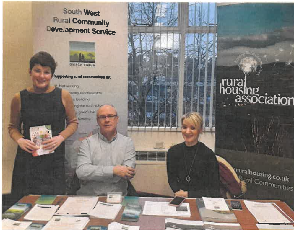
Omagh Forum share a table at Funder's Fair January 2020